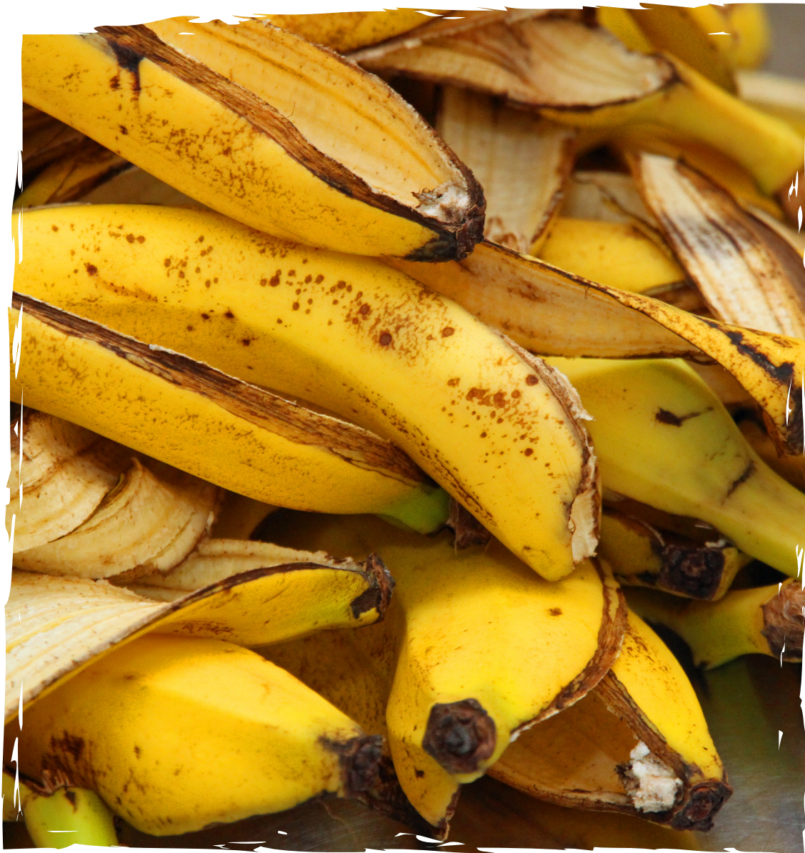
WASTE: Low-carbon liquid fuels made from waste are sustainable liquid fuels with no or very limited net CO 2 emissions during their production and use compared to fossil-based fuels.

Our proposed pathway is ambitious. The good news is our transformation has already begun.